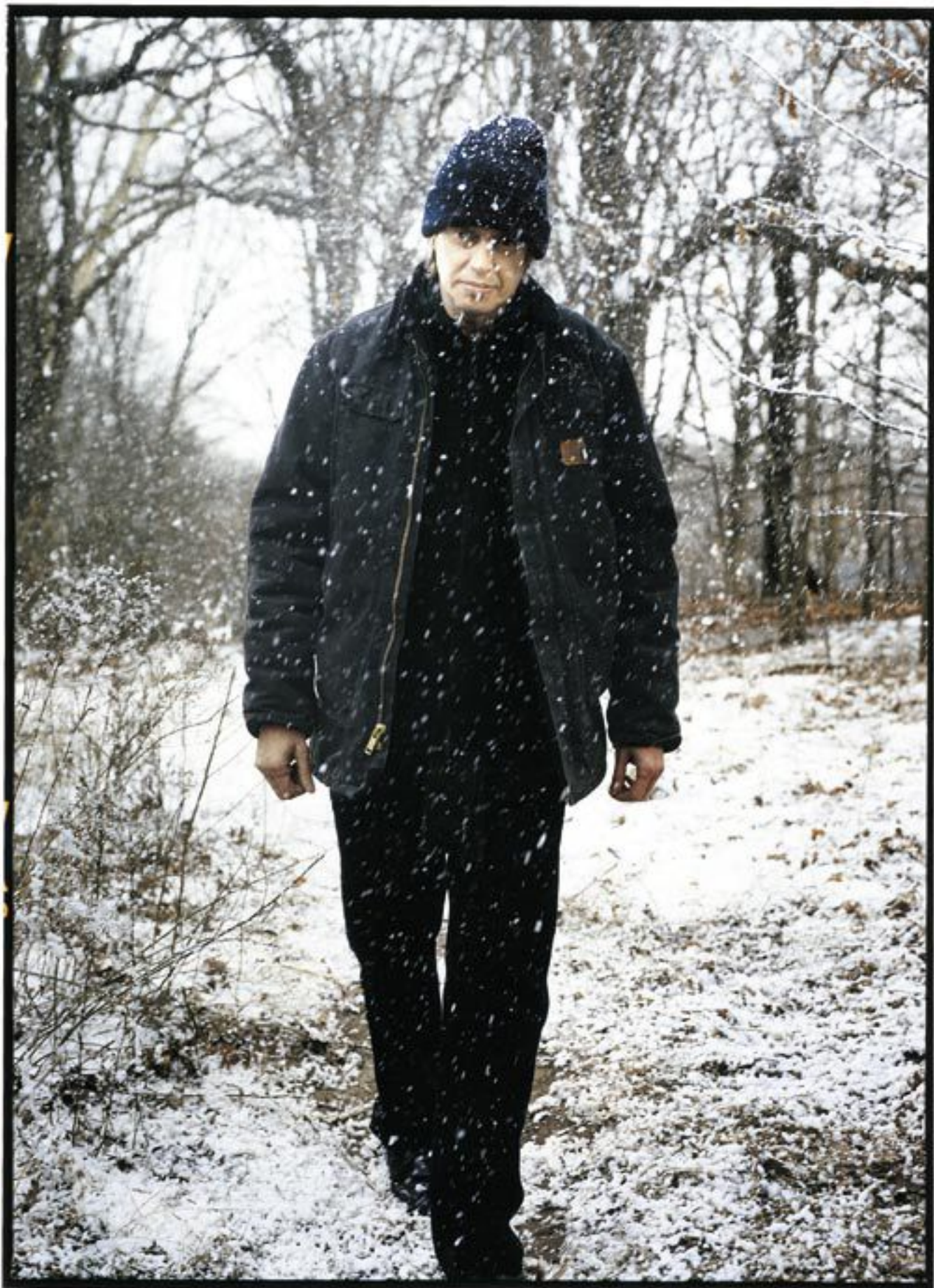
All Buscemi's characters are stuck in a purgatory from which they may or may not escape.